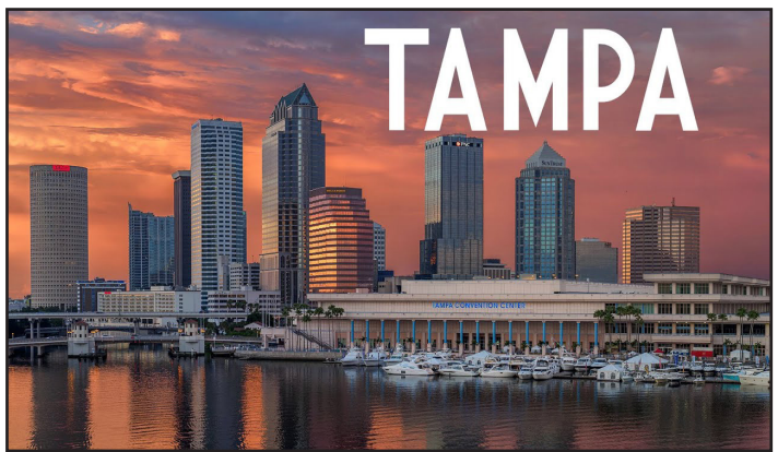
Board of Director's Meeting Tampa, Fl February 6 - 9, 2020

Hotel Information: Omni Shoreham Hotel Washington 2500 Calvert Street NW Washington, DC 20008 866-238-4218 Room block under "National Italian American Bar Association"