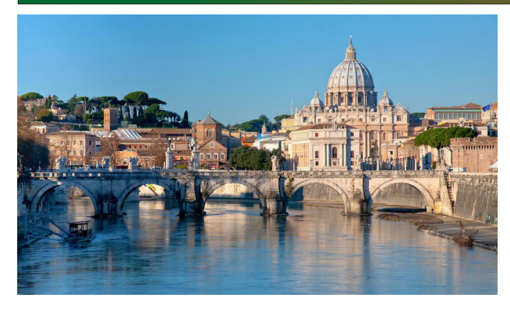
Rome, Italy CLE September 23-25, 2019

NIABA/IALA members are invited to attend a unique legal program in Rome, for which California-licensed attorneys may apply for CLE credit. (CLE credits may be available for other states also) Our schedule includes six lectures in English by Italian lawyers, dealing with topics specifically selected for U.S. attorneys who have U.S. clients needing legal assistance in Italy. Please see niaba.org complete for details. Still time to register!